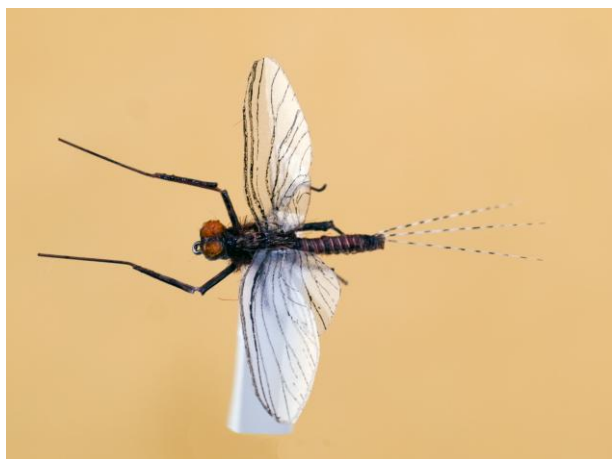
Second place in the National Championship and fourth in the Open contest in the category of realistic patterns- "Ephemerella Subvaria" by Uros Mahne from Ilirska Bistrica, Slovenia

Federation of Slovenia in Ljubljana. After completing the evaluation, we recalculated the total number of points for each pattern and ranked them. After a few days we have obtained formal results when numerical codes were associated with personal data of tiers. Following the decision of the newly formed jury, all authors of the competition deserve that all products should be well archived and published in the magazines internationally.