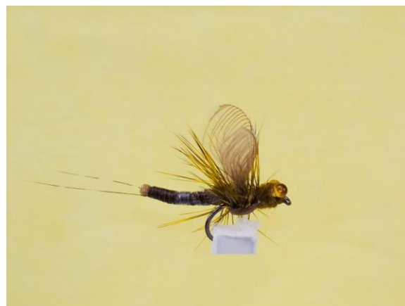
Second in Nationals and eight in Open contest in the dry fly category- "Bodi Betis" by Gregor Novak from Cerklje na Gori, Slovenia