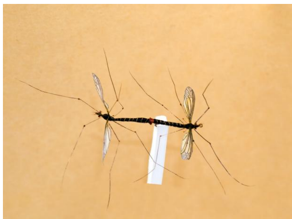
Second place in realistic patterns category "Tipule's coupling" of Hugues Silvain, France

We are pleased that the contest is reaching international level, which is probably due to opening our community in web space, basically blurring the boundaries between people of similar interests. I guess we all, as fly fishers, agree that real life communication takes place in a pleasant chat at the water. If friendship is true, this 'communication' which is taking places without a word blend in intersection between air and water. It's this border, which may be as sharp as a razor or just broken as only water can be where fish is the only judge of our deeds. Our work as the jury is no less demanding, but criteria for assessment are of a different nature.