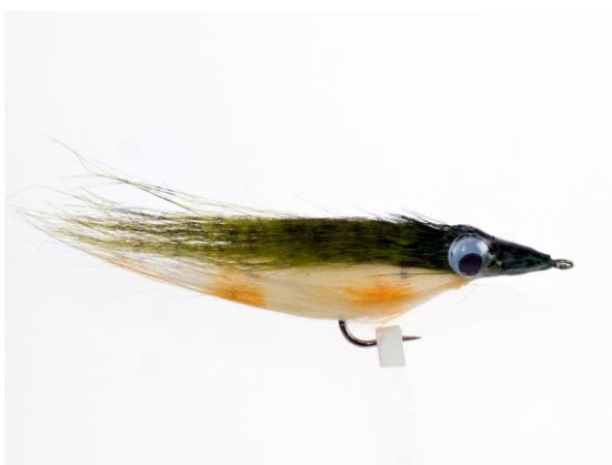
Third place in Open contest in the streamers category- "Luccio Pike" by Eros Tomassi from Italy