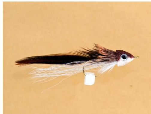
Second place in Open contest in the streamers category- "Sculpatuka" by Dustin Driscoll from USA