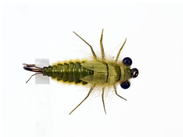
First place in the nymphs category- "Dragonfly Oliv" by Alfons Schefhold from Germany

The jury at this point recalls the repeated irregularities in submitted flies - please note two flies should be sent for the contest and is a major reason behind unrated flies (5 artificial flies). Following by the pre-categorization and thus avoiding duplication of products from the same author in each category, so we were forced to disqualify the lower rated pattern.