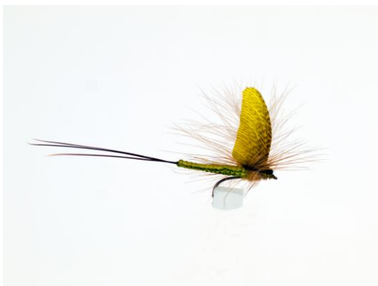
First place in the dry fly category- "Ephemera Danica" by Sasa Bencun- Roka from Serbia